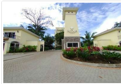
Condominium Complex Main Entrance