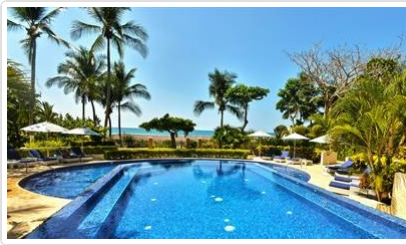
RST 1921 (2)