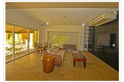
RST 1932 (1)